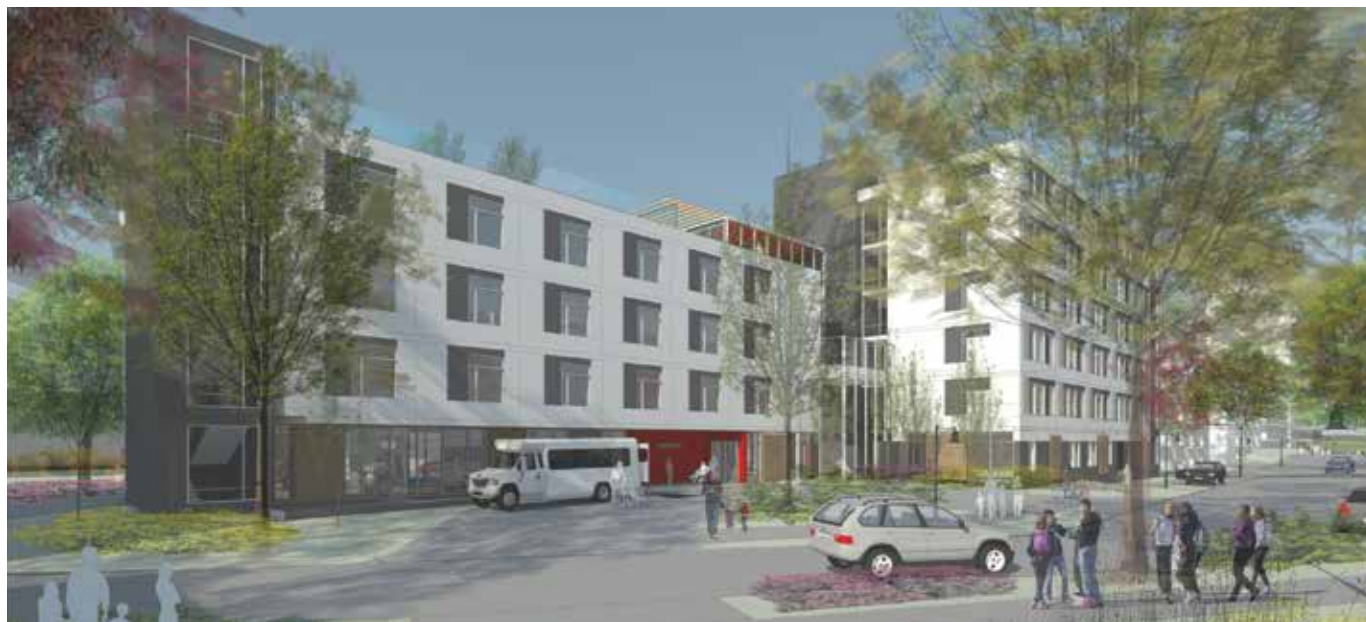
Artist rendering of the New Nigel House.

Since our last Moments Newsletter, Broadmead Care has been fortunate to receive tremendous support from Board members, staff, individuals, community groups and corporations. In fact, the community got behind the Nigel House Replacement Project with a $660,000 boost!